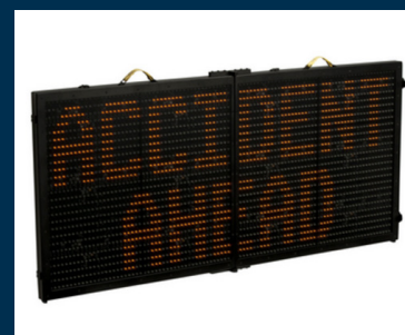
InstAlert 18 and InstAlert 24

Engineered and manufactured in the United States of America