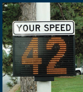
SpeedAlert 18 and SpeedAlert 24