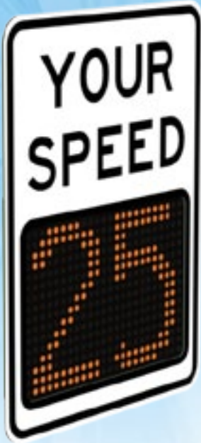
Part #: M75-9IDFB-000x